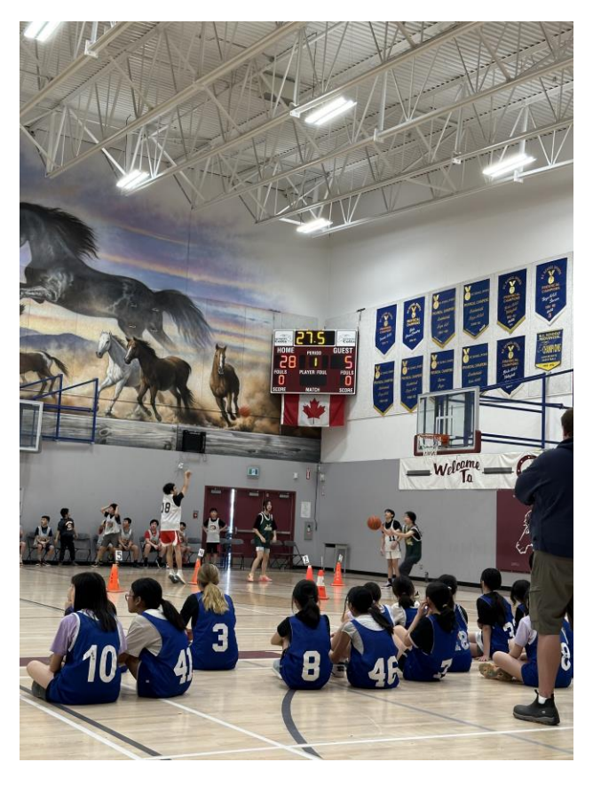
1 - Our students at the Colt Classic Basketball Tournament at Richmond High