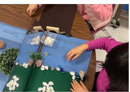
Div 18 students explored the themes of connections and memories in Story Workshop.