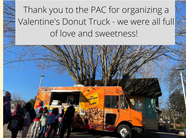
Thank you to the PAC for organizing a Valentine's Donut Truck - we were all full of love and sweetness!