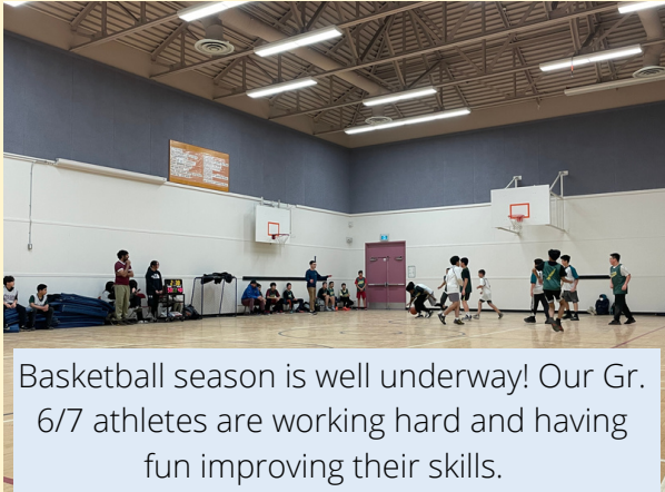
Basketball season is well underway! Our Gr. 6/7 athletes are working hard and having fun improving their skills.