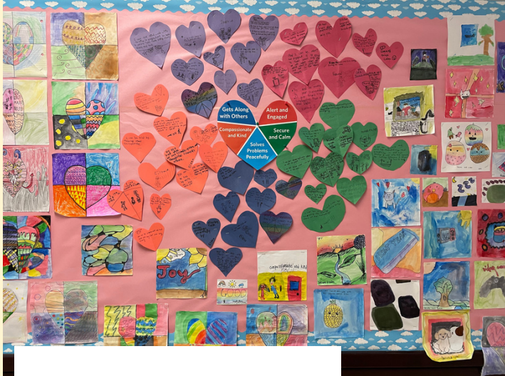
Sharing our we care through art! Div 13 students created Currie Cares images and Div 7 students shared their thinking through a heart collage.