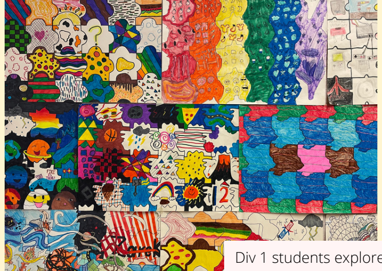
Div 1 students explored patterns through tessellations.