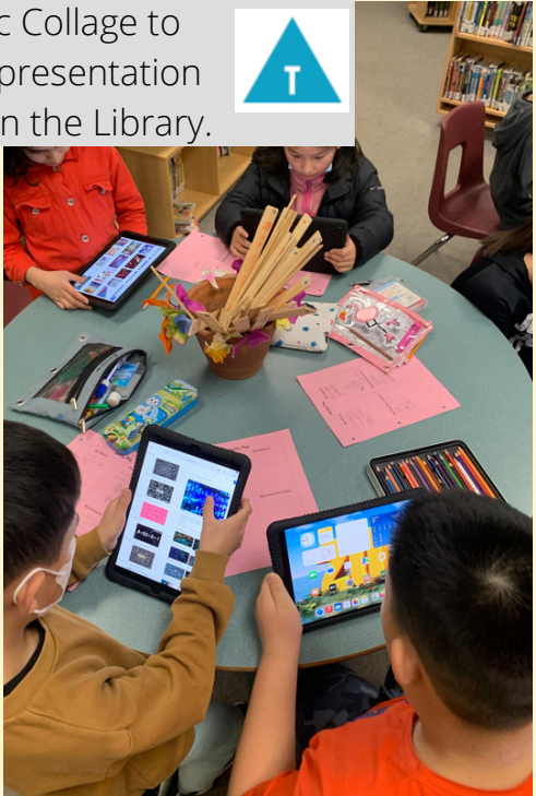
Div 11 students used Pic Collage to create an "All About Me" presentation during collaboration time in the Library.