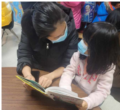
First Family Reading of the Year! Div. 20 students invited their families and grown ups to read together. Starting the day with connections, literacy, and smiles!