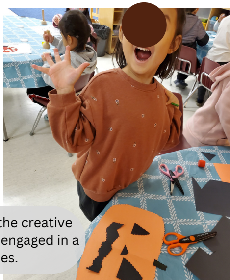
Div 21 students focused on the creative thinking competency as they engaged in a variety of fall activities.