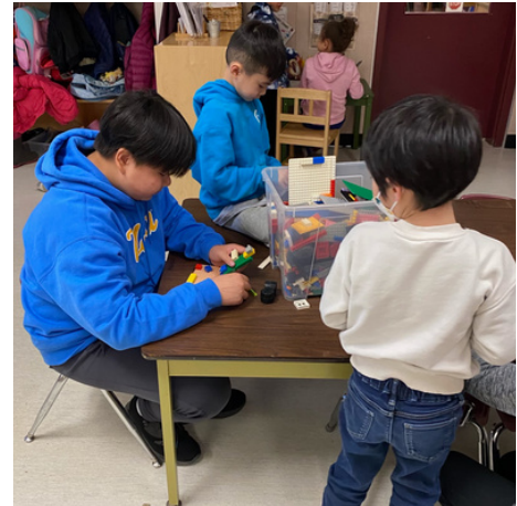
How might we build connections in our school? Gr. 7 and K students working together at Lego station.